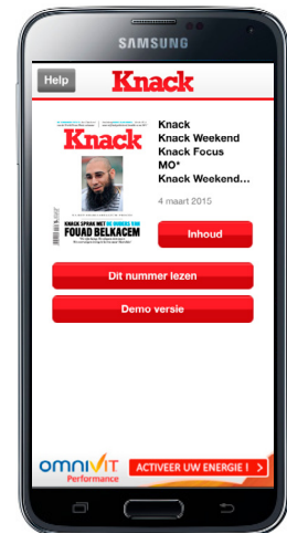
Leaderboard op print applicaties